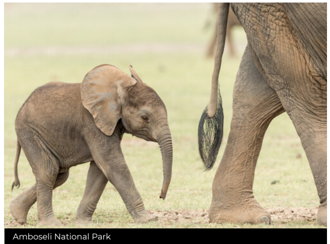
Amboseli National Park