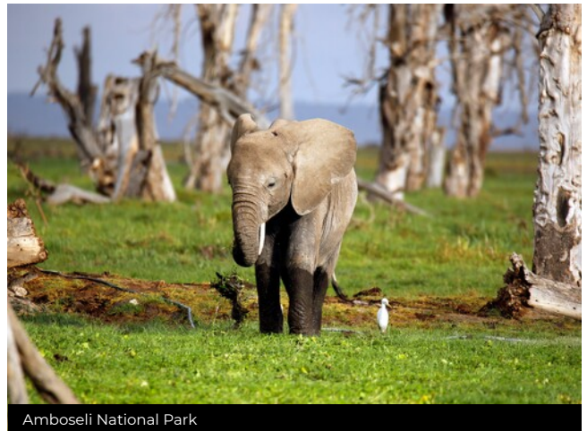
Amboseli National Park