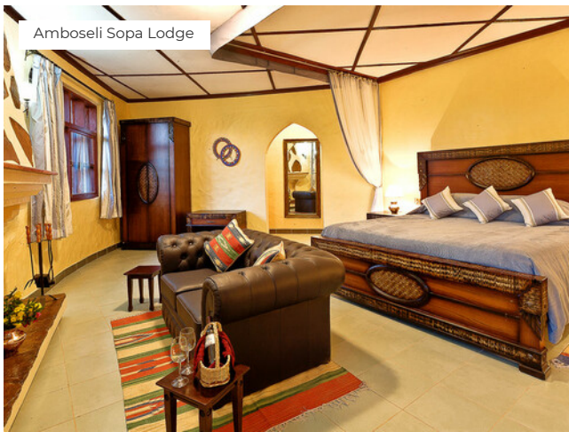
Amboseli Sopa Lodge